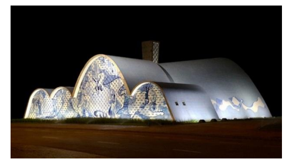
Rio de Janiero