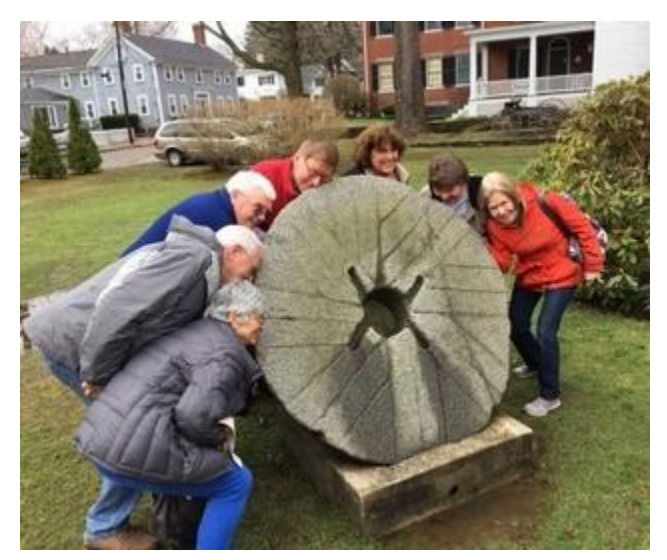
Friendship Force club presidents put noses "to the grindstone" at Dover's Woodman Museum.

PORTSMOUTH — Friendship Force of the New Hampshire Seacoast recently hosted the Northeast/Mid-Atlantic Regional Conference for Friendship Force members from clubs as far south as Virginia.