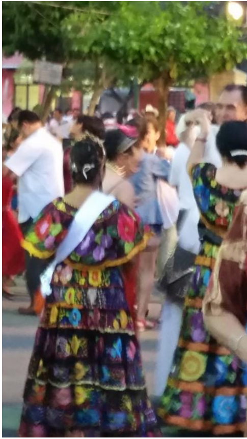
A visit to Marimba park to listen to music and watch people dance and enjoy the evening