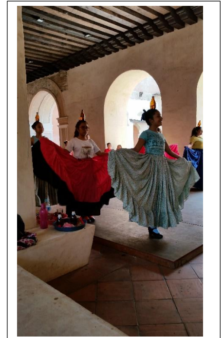
Where there was a traditional dance class being taught to young ladies