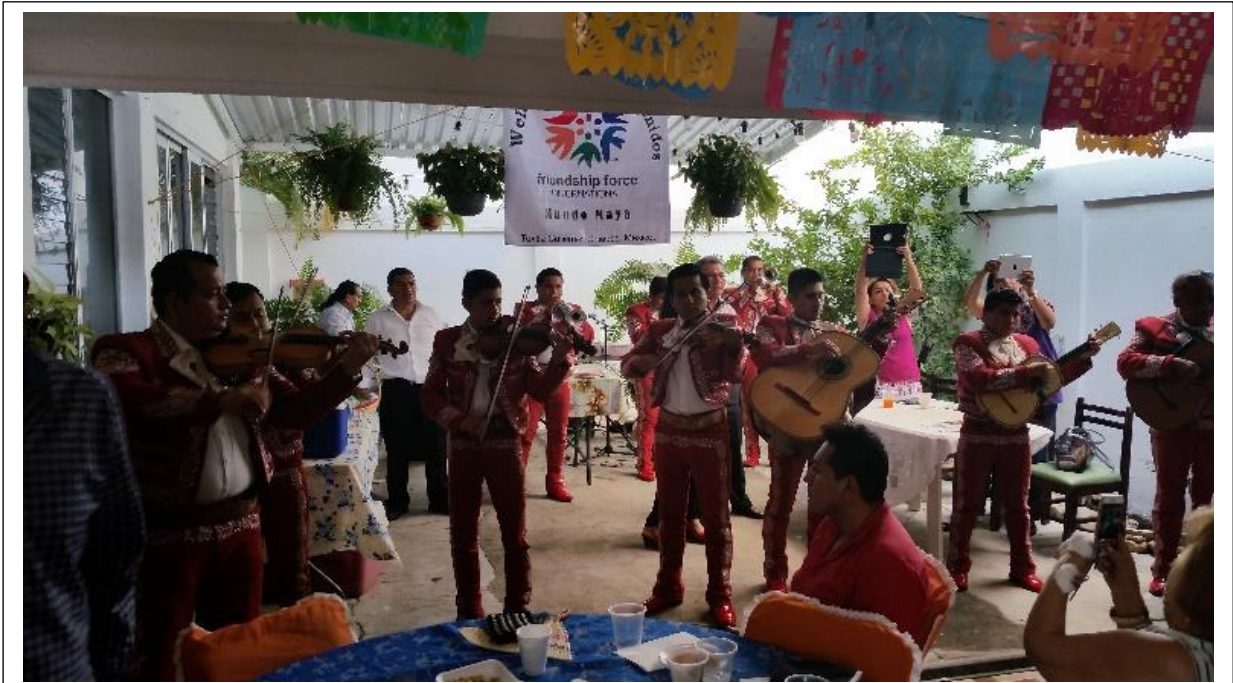
Our farewell would not have been complete without a traditional Mariachi Band