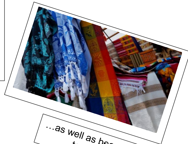
...as well as beautiful textiles