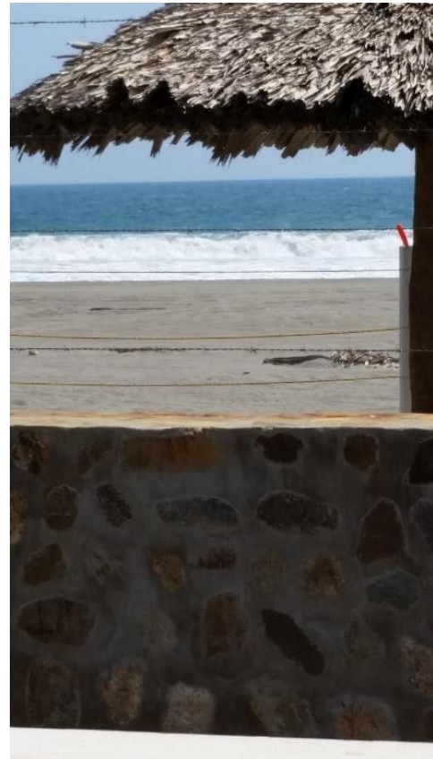
A trip to the Pacific Ocean to stick our toes into the water, if you were willing to pay the price of extremely hot sand to get to the water.