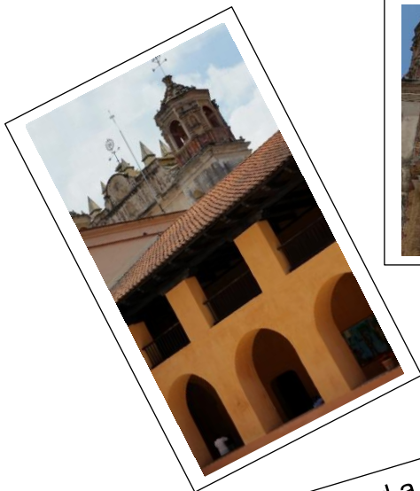
We visited San Cristobal which had a more traditional Spanish feel to the city. It also provided a rest from the heat...