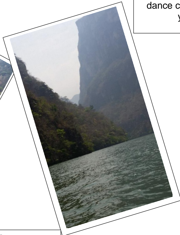
A trip up the Grijalva River