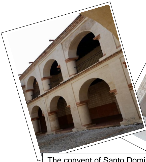
The convent of Santo Domingo