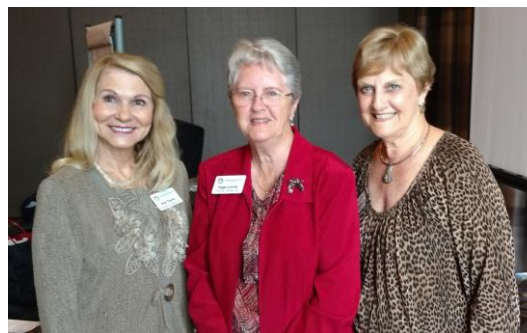
Panel Members for "Membership Recruitment and Retention"

All in all, the Conference was a very worthwhile event for all attendees. We learned lots of ideas that will help us improve our clubs and the way they operate.