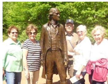
At Monticello with Thomas Jefferson