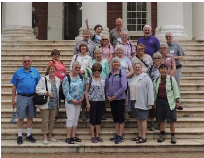
On the steps of the UVA Rotunda