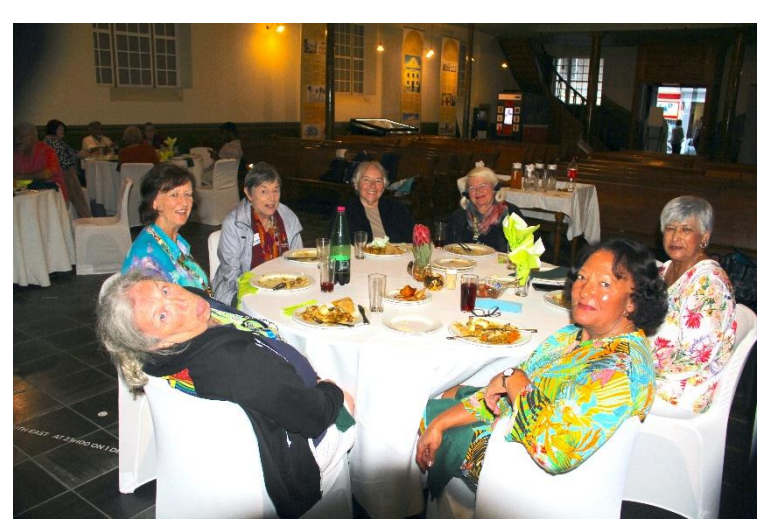
Farewell Party from Cape Town