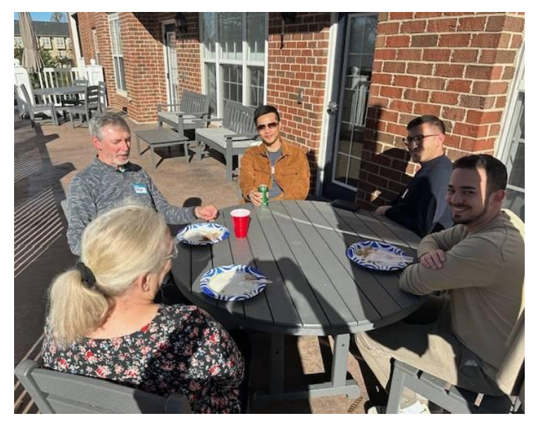
A Lovely Day Some even went to the patio