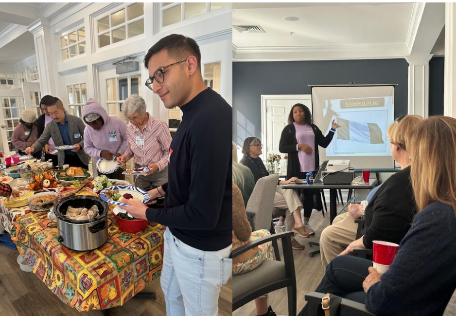
As always – lots of good food.